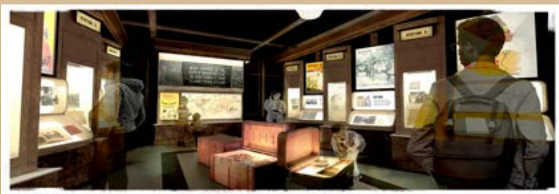
Artistic rendering of exhibit space.

In addition to new technologies, a museum renovation can also provide an opportunity to update and modernize the museum's displays and interpretation. This includes updating the language used to describe exhibits, incorporating new research and scholarship, or highlighting previously overlooked stories or perspectives. By doing so, we can become more inclusive and representative of a diverse range of experiences and perspectives, making them more relevant to a wider range of visitors.