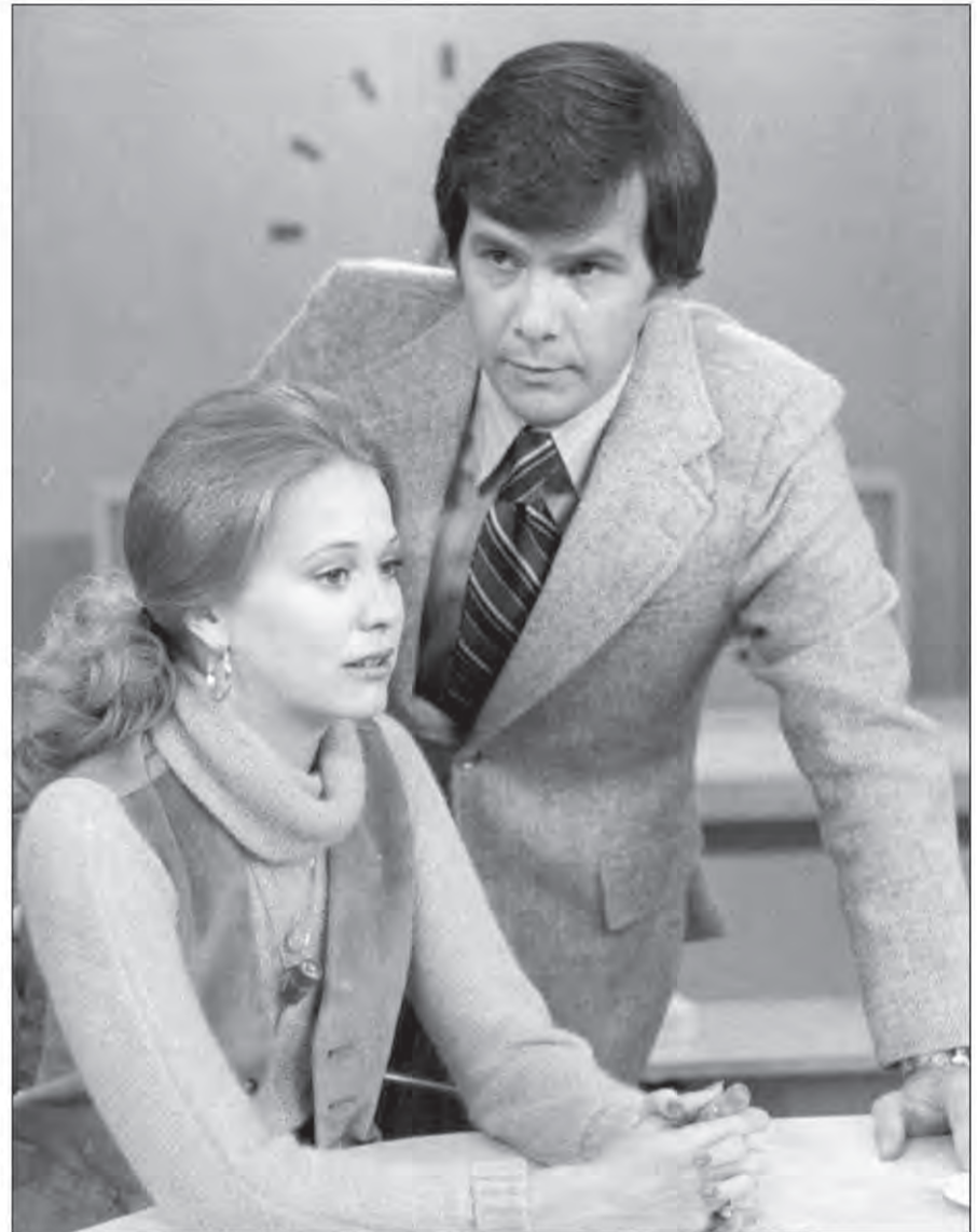
Jane Pauley and Tom Brokaw on the Today show set in 1977.

Table sponsors and Foundation members will be able to order their tickets before sales are opened to the public. Watch for announcements on our website, HooverPresidentialFoundation.org, or on our social media accounts including Facebook, Twitter and Instagram. ★