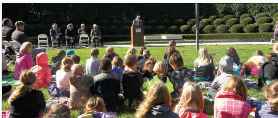
Students from nearby Hoover Elementary attend to learn more about the school's namesake.